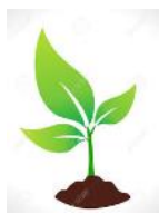
nu- room to grow